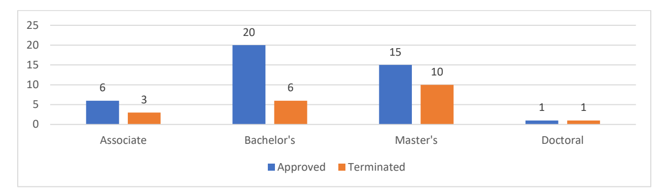
Figure 1. Terminated and Approved Academic Degree Programs by Degree Level

Note: If an institution is not listed in the two tables above, it did not terminate programs or receive approval for new programs during the reporting period.